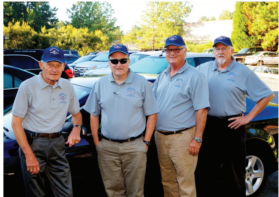
AmeriFleet has a wide-spread network of top-notch DOT and CDL certified drivers ready to move at a moment's notice.

And with AmeriFleet, you can trust that our network of skilled work truck drivers has been properly vetted and stringently trained. Perhaps even more important, we only partner with drivers who understand the unique challenges of operating work trucks. Drivers who are knowledgeable when it comes to the safe operation — and timely delivery — of what is usually the most expensive assets in any fleet. And at AmeriFleet, we pay work truck drivers better than almost any logistics provider, safeguarding your valuable assets and assuring we're providing the kind of partnership that can get trucks on the road faster — and making money sooner.